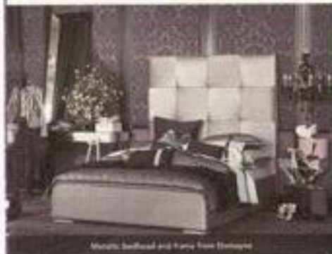
Metallic bedhead and vase from Hemming

Bedheads don't just look pretty – they also can be used for storage in smaller bedrooms, according to Andy Hemming from Sunshine