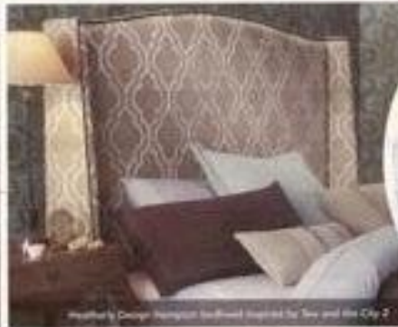
Heatherly Design bedhead inspired by The Sea and the City 2